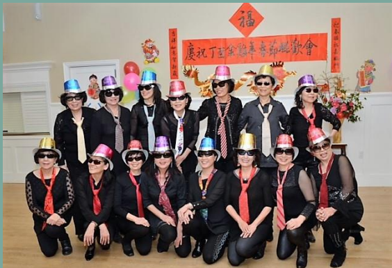
Celebrating Year of the Rooster

GCSC relies mainly on donations from members with little government and corporate funding. And all staffs are volunteers.